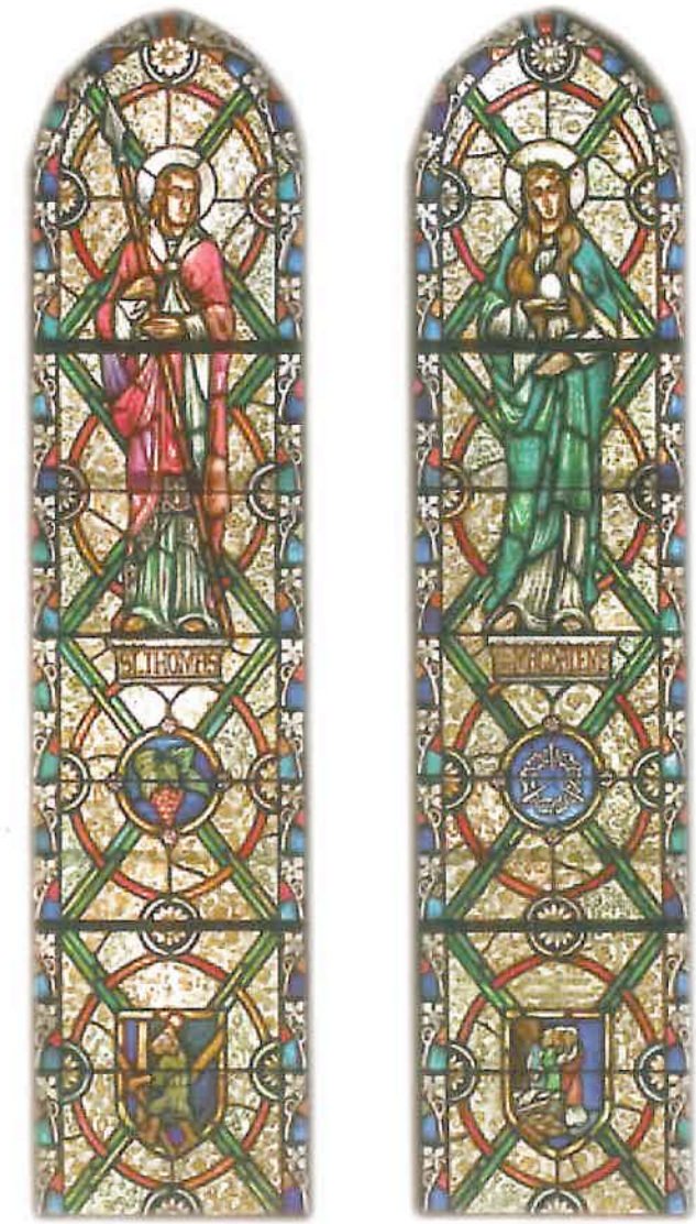
Saint Thomas Episcopal Church Hanover, NH